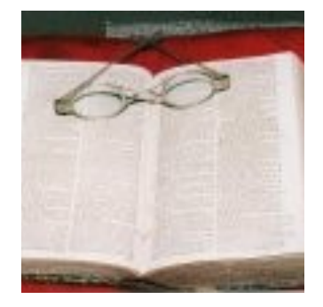
(letter 1st March 1818)